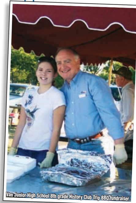
Van Junior High School 8th grade History Club Trip BBQ fundraiser

VOTING RECORD & ENDORSEMENTS National Rifle Association - "A" Texas Farm Bureau AGFUND- 94% Vote Record in 2005 Heritage Alliance Conservative Report- 90% Vote Record in 2005 Texas Eagle Forum- 80% Vote Record in 2005 Texas Assoc. of Business- 91% average since in House Champion for Free Enterprise distinction Texas Alliance for Life Texas Dept of Public Safety Officers Association PAC Young Conservatives of Texas Texas Home School Coalition PAC Texas Public Employees Association Texans for Lawsuit Reform PAC Texas Farm Bureau (Web Site) Independent Bankers Association of Texas Political Action Committee of Engineers Business and Commerce Political Action Committee Texas State Association of Fire Fighters Texas Medical Association Political Action Committee Texas Hospital Association HOSPAC Texas Apartment Association Texas Association of Realtors Combined Law Enforcement Assoc. of Texas